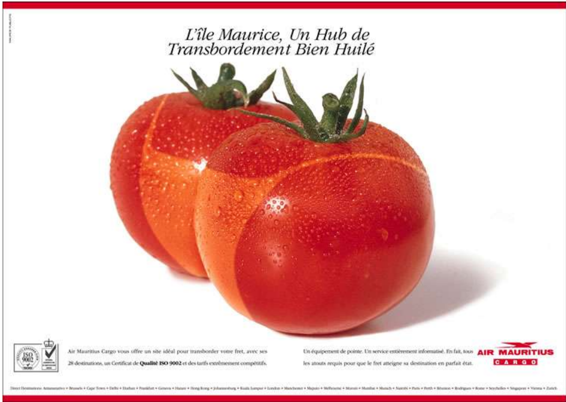
"Mauritius - The Well-Oiled Transshipment Hub" - Perishables are one of the main cargos that Air Mauritius transports.