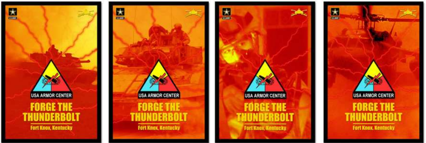
Poster proposals for a training centre. This client was a military supplier who found me on Google.