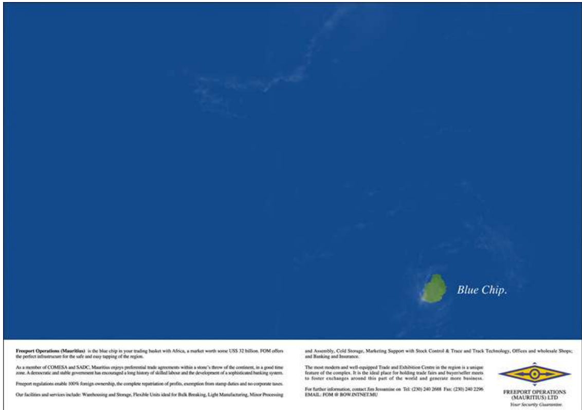
The objective was to present the island of Mauritius as a safe place to invest in