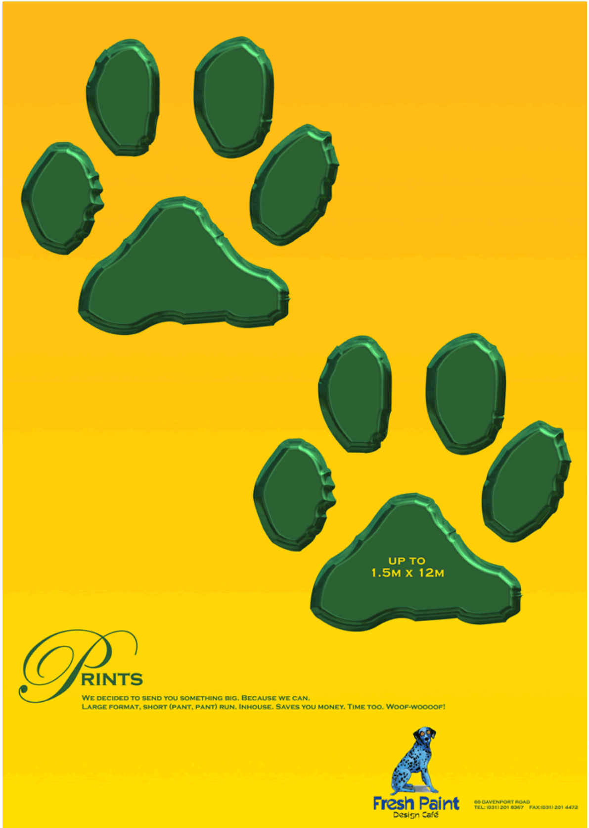
Poster for a design studio - size: A0 (big). One of the services they offer is large-format inkjet printing. Everything revolved around their logo device, the blue dog.