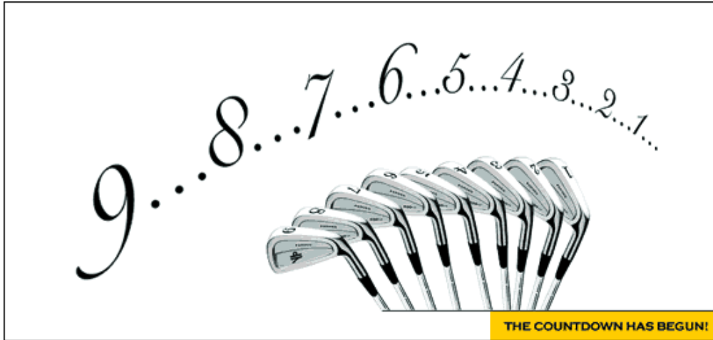
Invitation to a golf tournament.